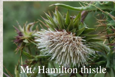
Mt. Hamilton thistle