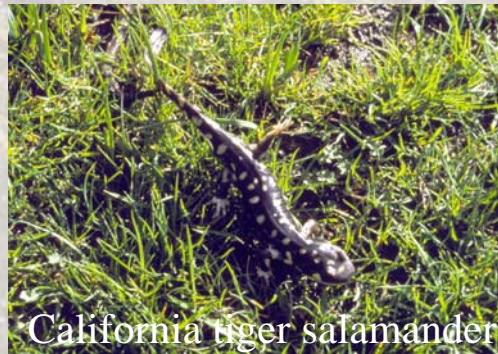
California tiger salamander