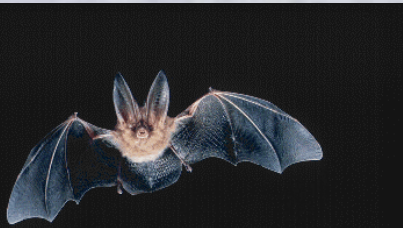
Townsend's big-eared bat

Currently recommend 35 species be covered by Plan: 18 wildlife species