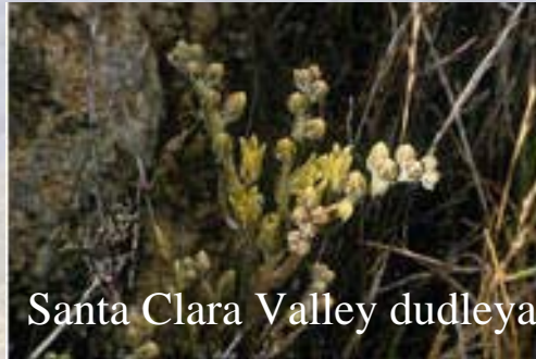
Santa Clara Valley dudleya