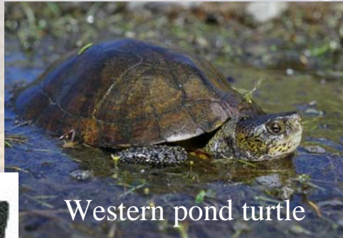
Western pond turtle