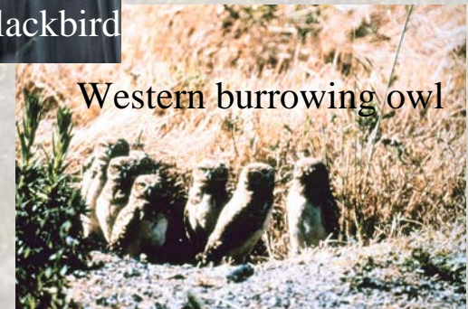
Western burrowing owl