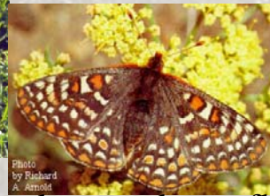
Bay checkerspot butterfly