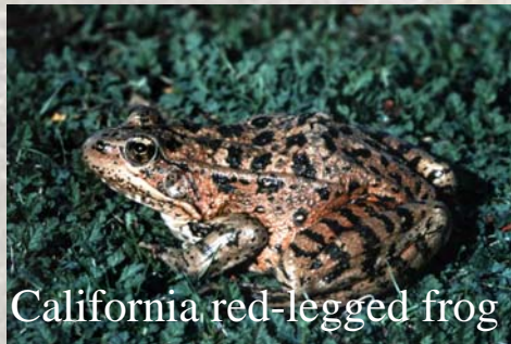
California red-legged frog