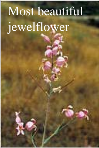
Most beautiful jewelflower