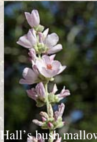
Hall's bush mallow