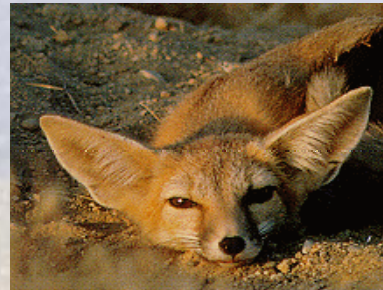
San Joaquin kit fox